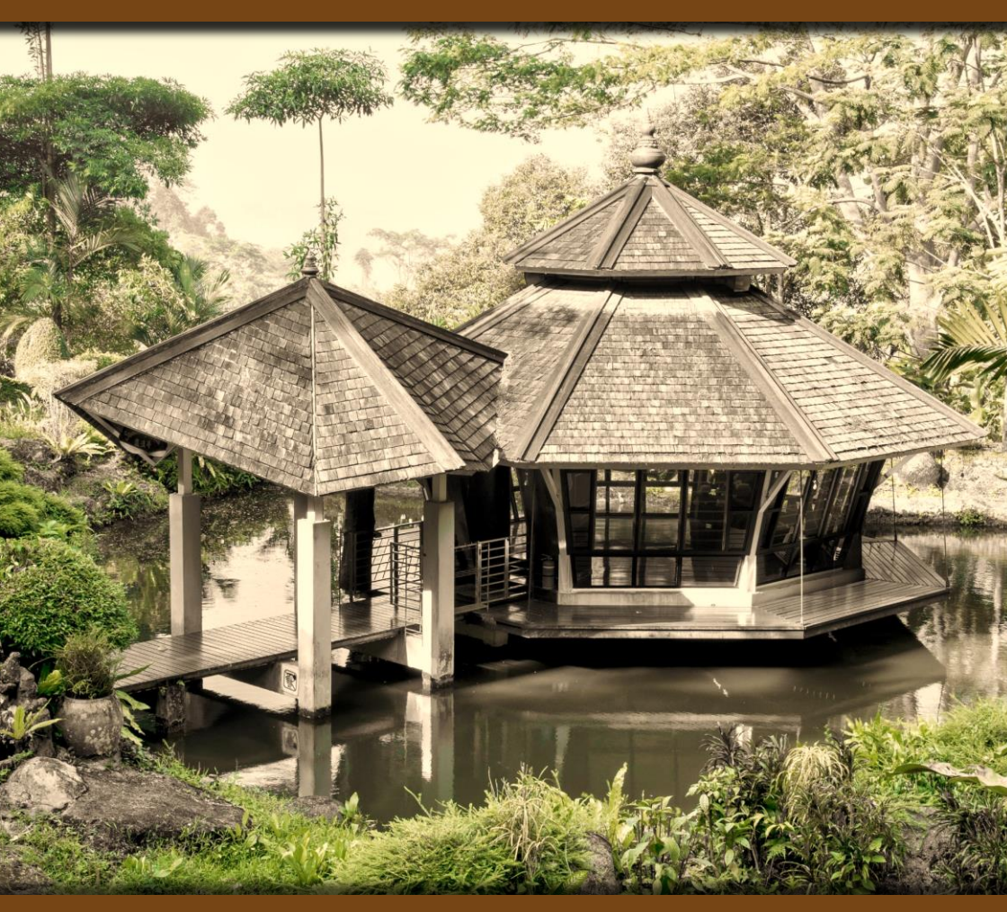
PĀLI - ENGLISH RECITATIONS